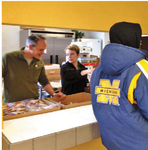
Temple members helped serve at the soup kitchen.