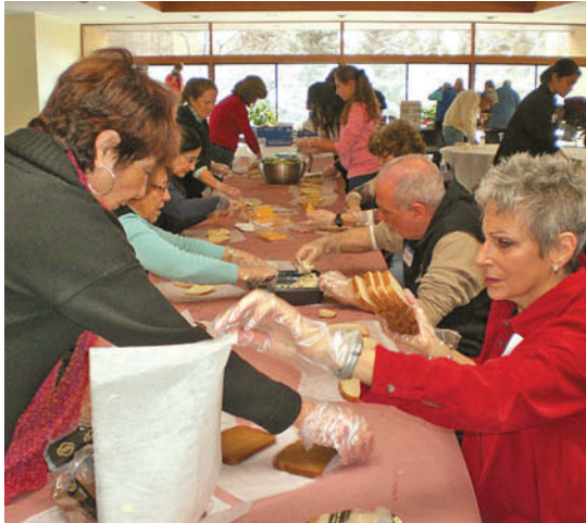
Temple members work on the sandwich assembly line.

Temple members chose February for this project because they were told it was a difficult time to find volunteers. Feeding the hungry is an expression of the congregation's deepest moral values. □